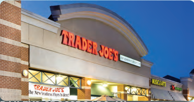
BAILEYS CROSSROADS- VA