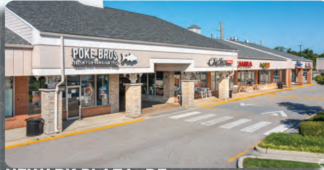
NEWARK PLAZA- DE