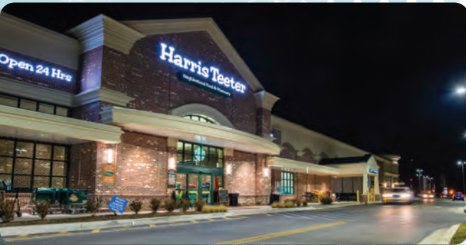
MAGOTHY GATEWAY- MD