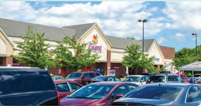
ROCK SPRING SHOPPING CENTER- MD