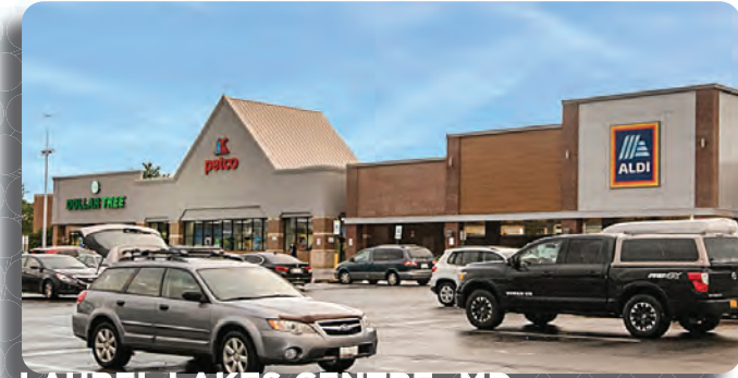
LAUREL LAKES CENTRE- MD