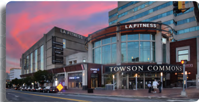
TOWSON COMMONS- MD