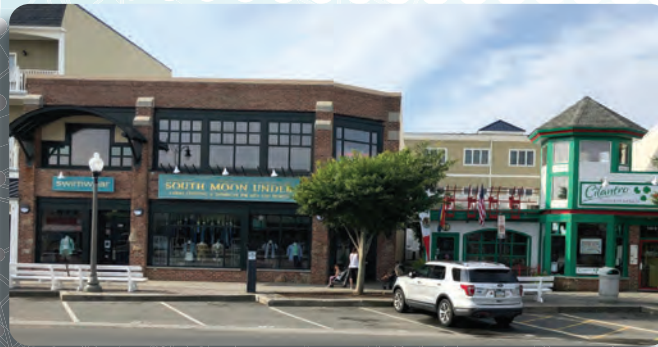
120 REBOOTH AVE- DE