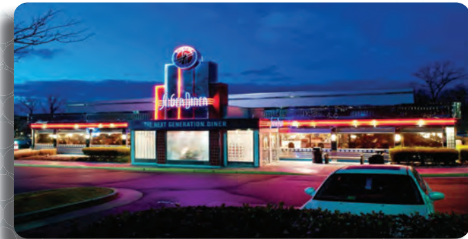
RESTON CORNER- VA